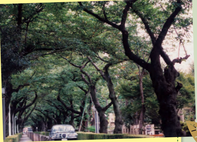
Lush green in Aoyama Cemetery

The trees in Aoyama have the growth rings. Aoyama 1-chome through Gondawara. The street in front of Aoyama Funeral Hall. According to our measurement, giant tall trees with trunk diameters of 1.5 to 2 meters stand 10 to 13 steps apart. Tulip poplar or Magnolia family are planted each labeled with the name and number. The large leaves similar to that of plane trees provide perfect shades. The plane trees in Aoyama-dori, ginkgo trees in Gaien-dori, zelkova trees in Omotesando and acacia trees in Miyuki-dori. They are constantly absorbing CO 2 . We must appreciate and take good care of these routes.