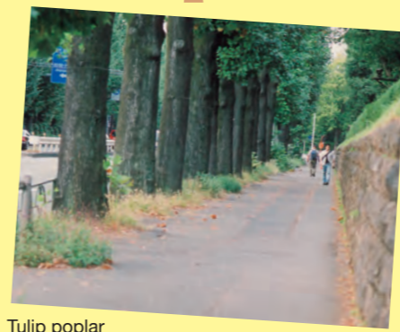
Tulip poplar in Aoyama 1-chome through Gondawara

The trees in Aoyama have the growth rings. Aoyama 1-chome through Gondawara. The street in front of Aoyama Funeral Hall. According to our measurement, giant tall trees with trunk diameters of 1.5 to 2 meters stand 10 to 13 steps apart. Tulip poplar or Magnolia family are planted each labeled with the name and number. The large leaves similar to that of plane trees provide perfect shades. The plane trees in Aoyama-dori, ginkgo trees in Gaien-dori, zelkova trees in Omotesando and acacia trees in Miyuki-dori. They are constantly absorbing CO 2 . We must appreciate and take good care of these routes.