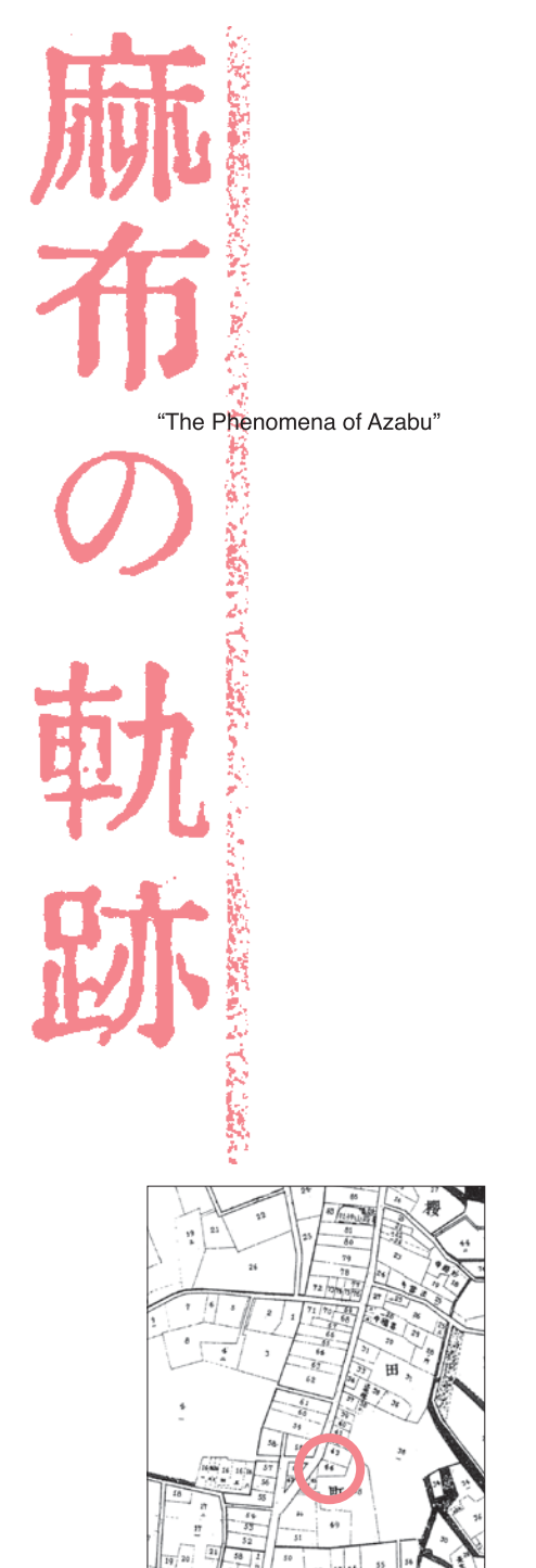
They lived at what was then 44 Sakuradamachi. Azabu

Edited by the Minato Local History Museum Enlarged Minato City History Collection Published by Azabu/Roppongi Compiled from the Tokyo Post & Telegraph Office