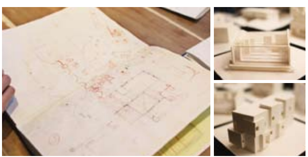
Design drawings with many ideas written on them and architectural models.

I was good at drawing and manual arts from when I was in elementary and junior high school and wanted to find a job in which I could use this talent. I first thought of becoming a painter but decided to become an architect because I thought it was easier to understand how this job could contribute to people and society. I, therefore, decided to major in architecture when I applied for university.