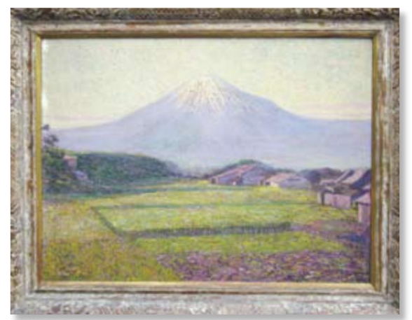
At Iwabuchi By Perry Owned by the Embassy of the United States of America