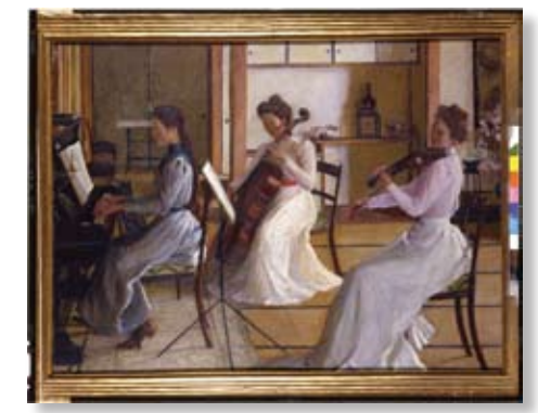
"The Trio," Collection of the Harvard Art Museum, Fogg Art Museum

The Perry's return to Boston in 1901 and Lilla continued to paint in the Impressionist style for the rest of her life. The Perry Family has been the bridge between Japan and the United States since the days of Commodore Perry.