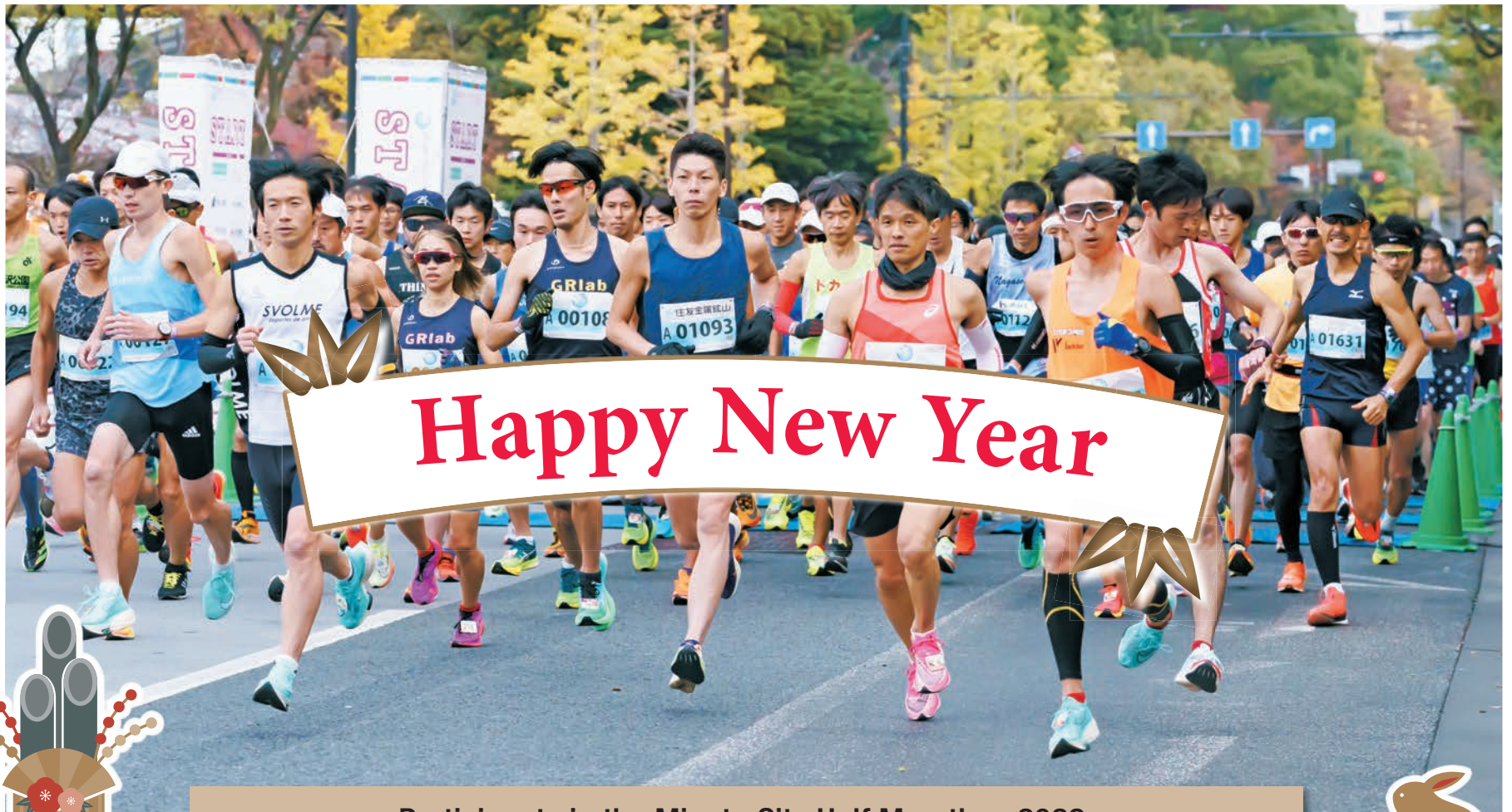
Participants in the Minato City Half Marathon 2022.