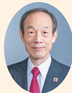
TAKEI Masaaki, Mayor of Minato City