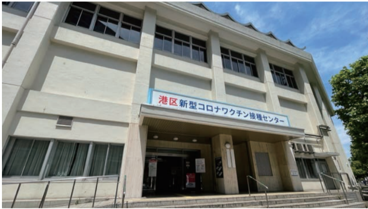
Minato City COVID-19 Vaccination Center