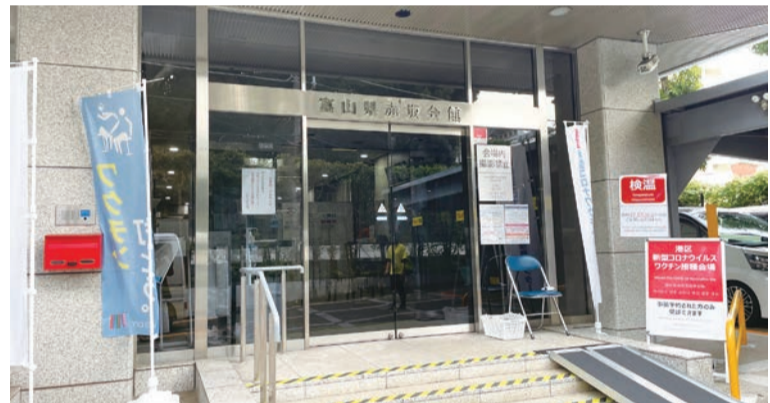
Minato City COVID-19 Vaccination Center 2

Conducting vaccinations for non-resident without reservation, at both venues regardless of address. Bring the vaccination voucher received from your municipality and personal identification. For people without reservation, enter the site at least 30 minutes before the end of the morning or afternoon vaccination sessions.