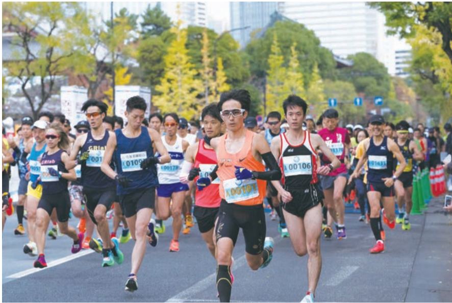
Half Marathon 2022