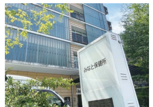
Minato Public Health Center

Weekends and national holidays: 8:30 a.m. to 5:30 p.m.