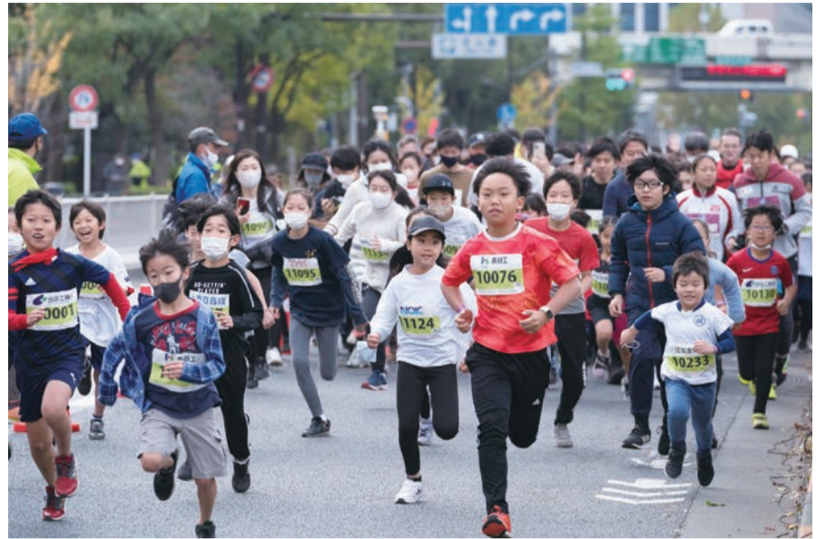
Fun Run 2022