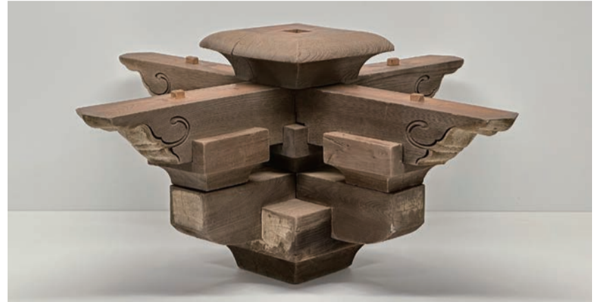
Wooden structure of temple