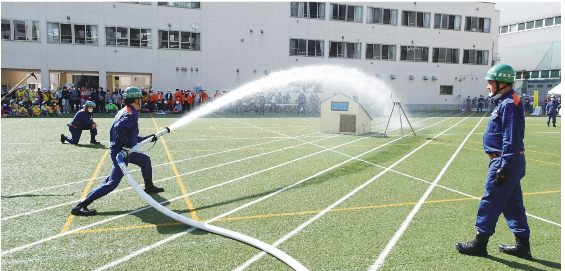
Disaster Preparedness Drill in 2022