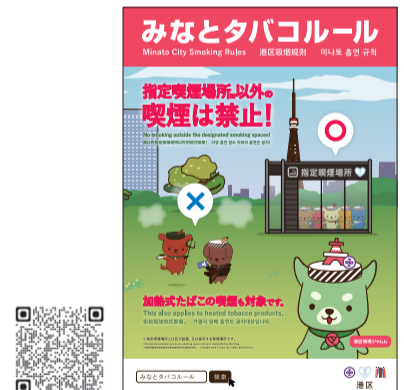
Minato City Smoking Rules Poster