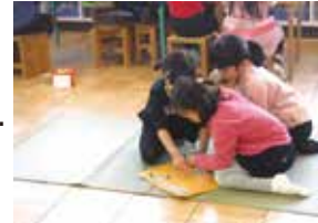
Playing a boardgame you made yourselves