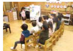
Sharing thoughts and opinions in front of friends