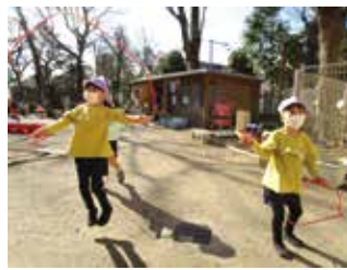
Playing jump rope outdoors